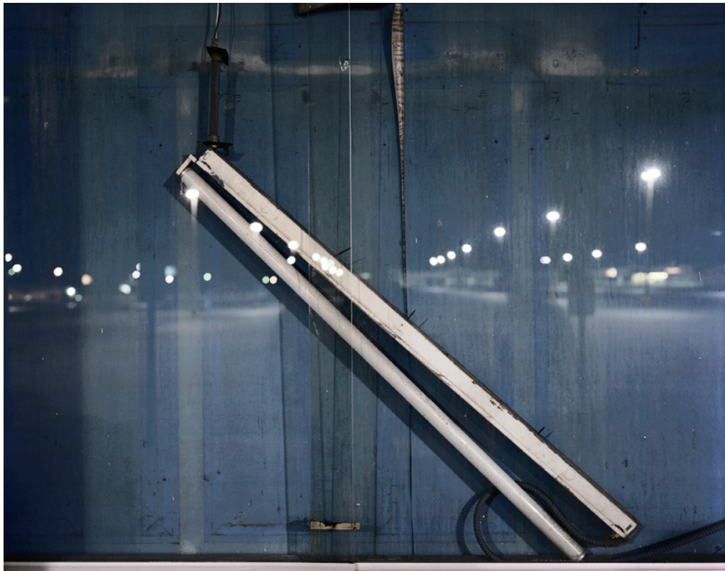
Brian Ulrich, Cinema I-IV , 2008

thunder in my throat. The brief but dangerous flirtation with heroin as a young adult should have come as a surprise to no one.