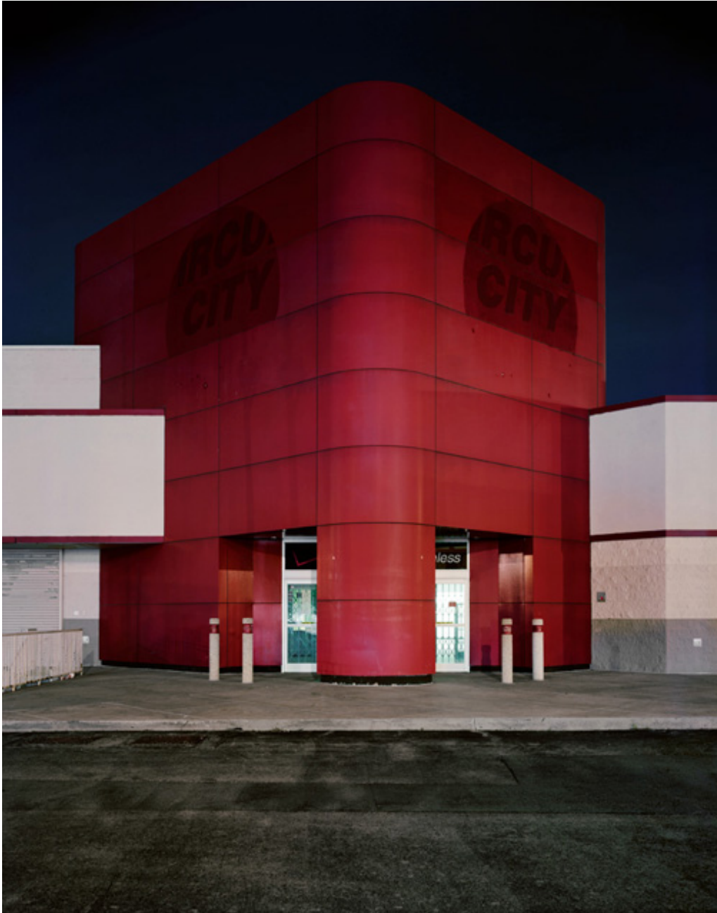
Brian Ulrich, Circuitry City , 2008

FOUR - "I'm looking for a Taylor Swift album."