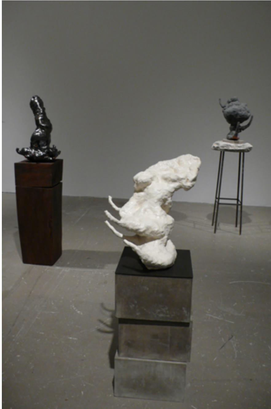
The work of Arlene Shechet.

Clay lends itself to a natural impulse to make a vessel, maybe because this is one of the first things we are taught, since it can seem (falsely) easy. The pieces in the show that worked with the idea of a vessel and its functionality were the ones I was drawn to most. Arlene Shechet makes vases, cups, or bowls that become sculpture with little relation to functionality. Her clay pieces are volumetric and are constructed with coils. She uses the clay to build forms in an organic process, allowing the pieces to evolve into something unplanned. Her surprising works, with their handmade ganglia of arms and trunks, are personal without becoming sentimental.