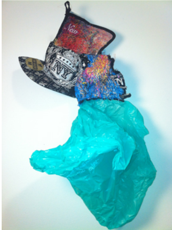
Sidney Russell, Untitled , 2012. 21 x 13 x 10", plastic shopping bags, NY baseball hat, NY pot holder, thread

I was lost long after moving to New York. Climbing out of subway stations disoriented. Constantly turned around.