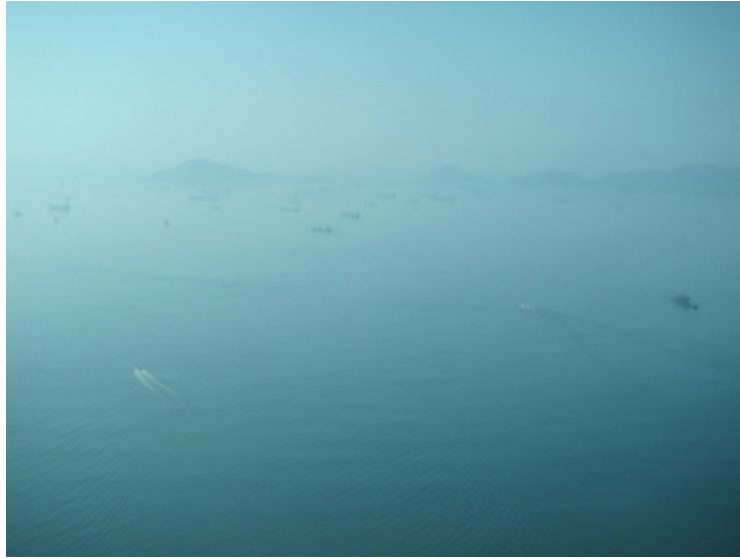
Aerial view of Panama City coastline, 2011

The top of Ancon Hill is the highest point in Panama City, Panama. It is a patch of concrete restraining a jungle.