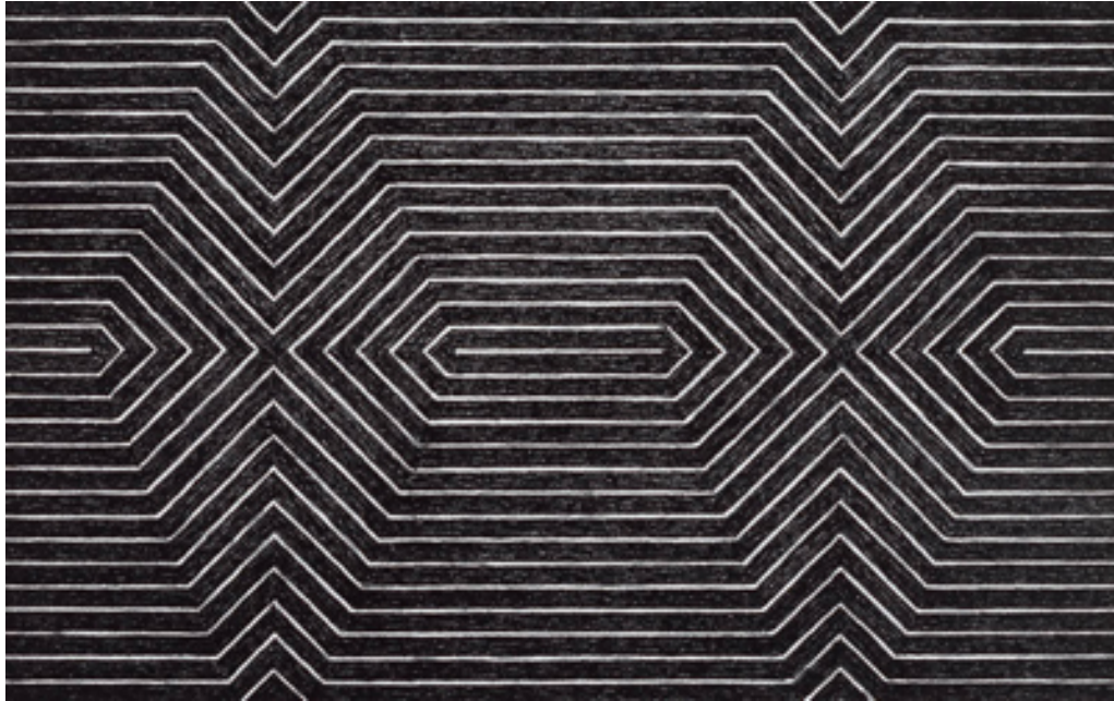
Frank Stella, Turkish Mambo from Black Series II , 1967, (cropped). One from a portfolio of eight lithographs, composition: 10 x 15 15/16" (25.4 x 40.5 cm); sheet: 14 15/16 x 21 15/16" (38 x 55.8 cm). Museum of Modern Art, New York, Gift of Jasper Johns, 530.1992.1 © 2012 Frank Stella / Artists Rights Society (ARS), New York