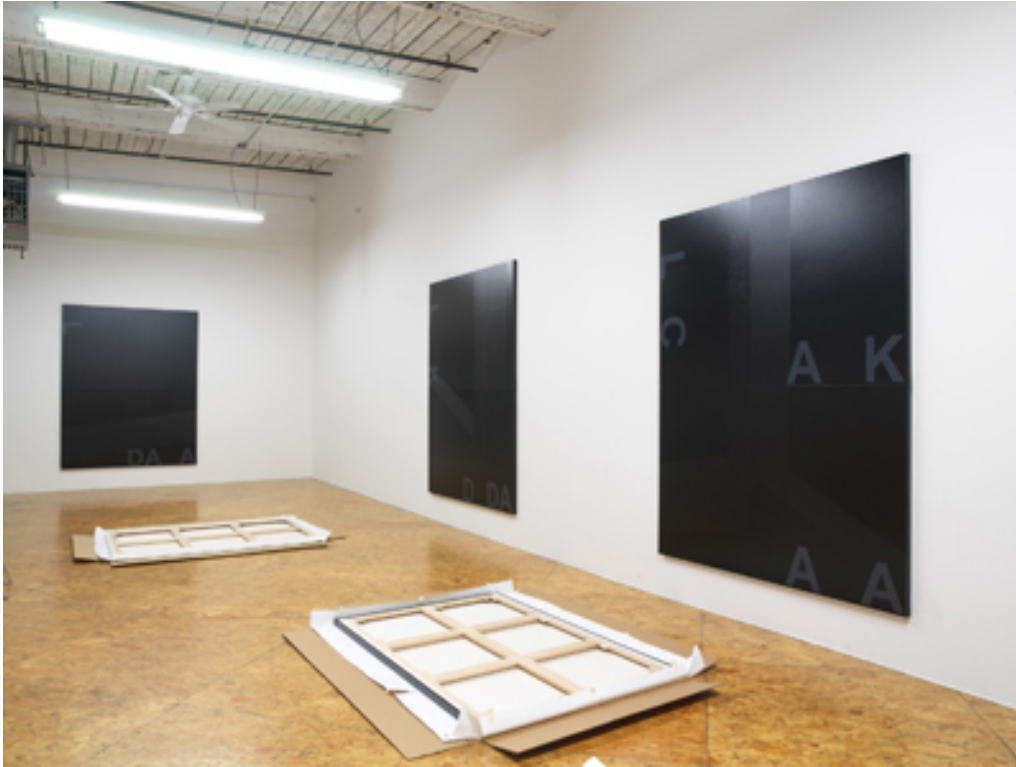
Adam Pendleton's studio

GS: This still seems a little vague... Could you be more specific about the kinds of narratives and meanings you are aiming for?