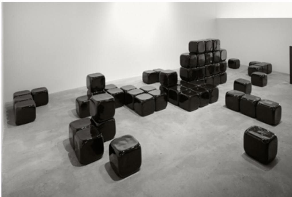
Adam Pendleton, Rendered in Black , 2007, Installation of 65 unique glazed 10-inch ceramic black cubes, 41"×228"×135".

For me, it's much more about the idea than the medium. An idea is typically developed and is often materialized by working with and through different mediums. Operating from that position I've always thought of language as an image-making device and image as a language-making device. The separation between text and image is such a dominant, dogmatic, and problematic position. The actuality of experience is much too complex for a binary approach. So I work hard to make sure things are, and remain, fluid; that both (text and image) are on the same plane if not literally, then at the least theoretically. One defines the other. One can redefine the other so the work is a perpetual space of/for feedback and conflation.