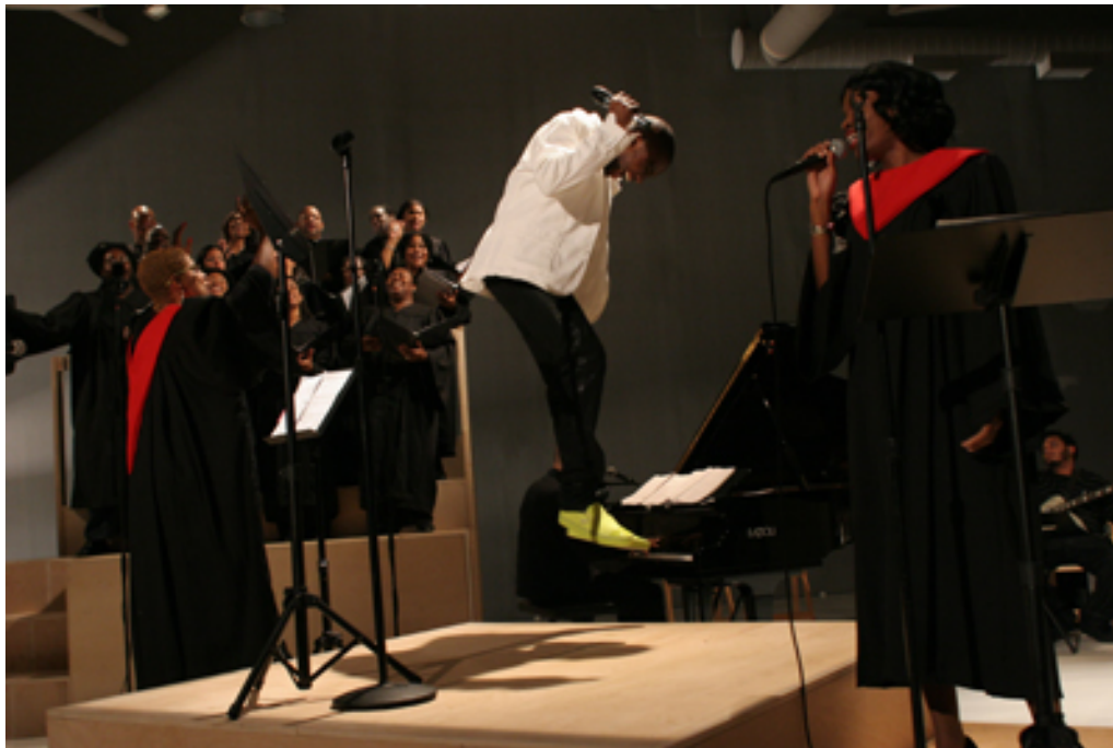
Adam Pendleton, The Revival , 2007, performed as a part of Performa 07.

I've also never thought of my work as spoken word as much as centered around or concerned with multiple voices, which can be located in the various sources I pull from. In a lot of my work there is a tension between a rule-based and formal approach. The lines in the Black Dada manifesto presented at Manifesta 7 build according to rules I laid out for myself when I began to write the text, which ended up having formal results such as rhythm. When I perform I've come to think of myself as a character suspended somewhere between fact and fiction or a fact of fiction.