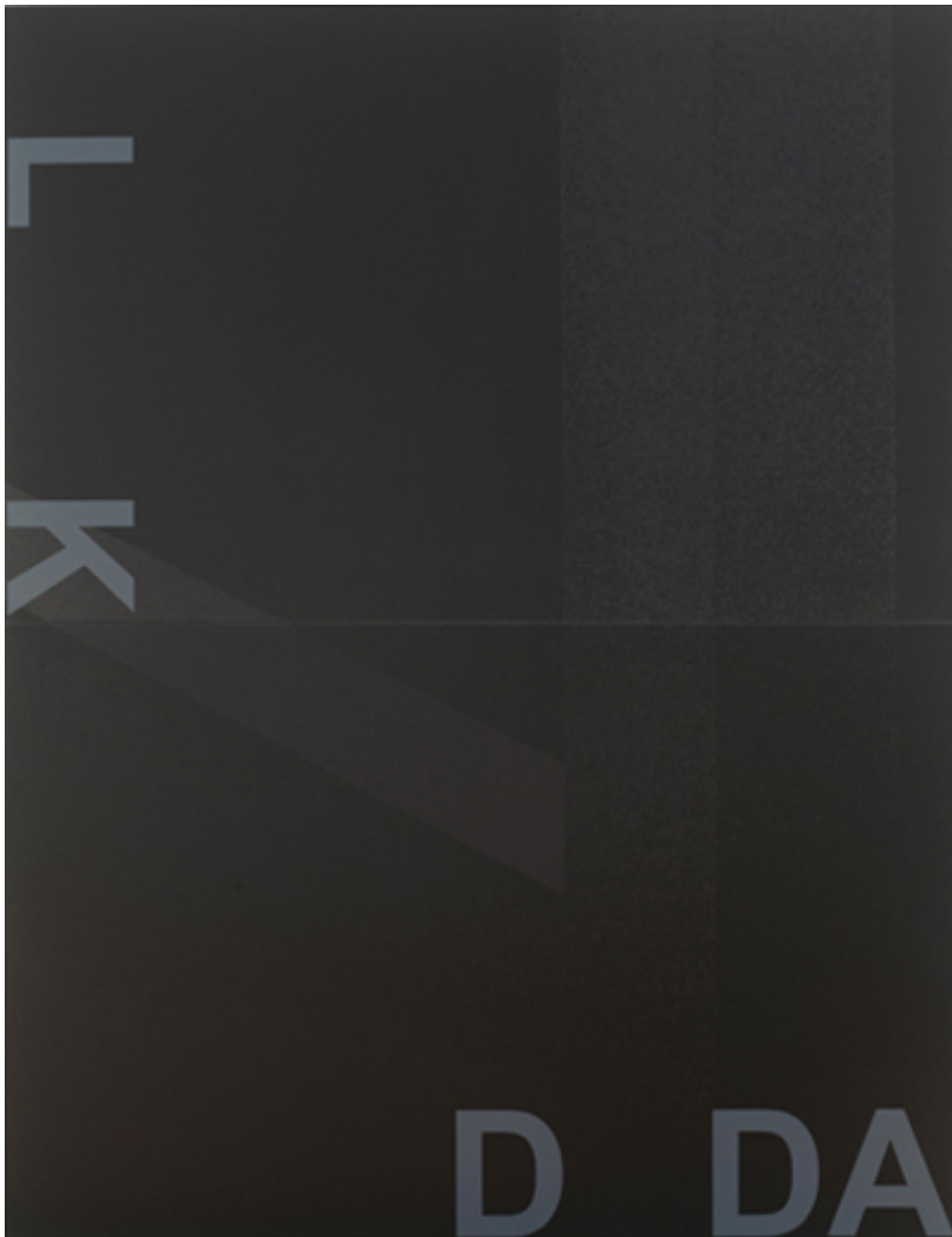
Adam Pendleton, Black Dada (LK/DDA) , 2008, silkscreen on canvas diptych, each panel 47

GILLIAN SNEED: As a painter, performer, and writer, your artistic practice is obviously cross-disciplinary. You mentioned in another conversation we had the frustration you sometimes feel when people in the art world get a brain cramp when they can't easily categorize you: "Are you a painter, a performance artist, or a writer?" they ask. To me, the silkscreen paintings and the performances seem so naturally linked, especially through their use of text. I was wondering if you could speak to the relationships among your various bodies of work, and especially your approach to textual material.