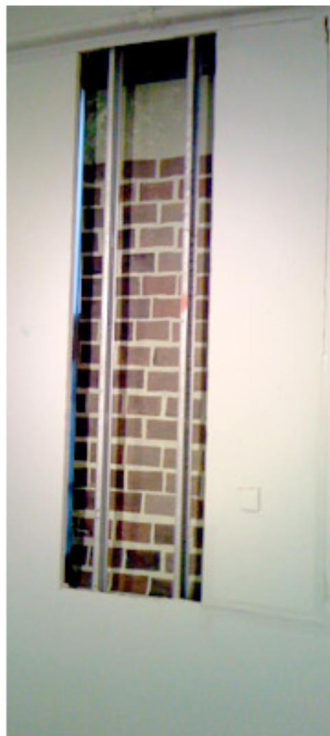
Lisa Sigal, Two Shades , 2007. Mixed media, 118×27 in. Courtesy Frederieke Taylor/Lisa Sigal, The Brick Piece , 2007. Mixed media, 102 × 54 × 16 in. Courtesy Frederieke Taylor