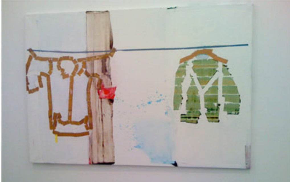
Magnus Plessen, Execution , 2006. Oil on canvas, 75.98 × 111.81 in (193 × 284 cm).