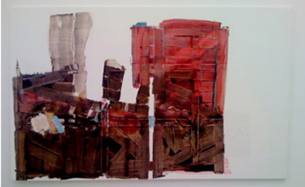
Magnus Plessen, Paravent , 2007. Oil on canvas, 68.11 × 110.24 in (173 × 280 cm).

(Something to hold up something worth looking at)