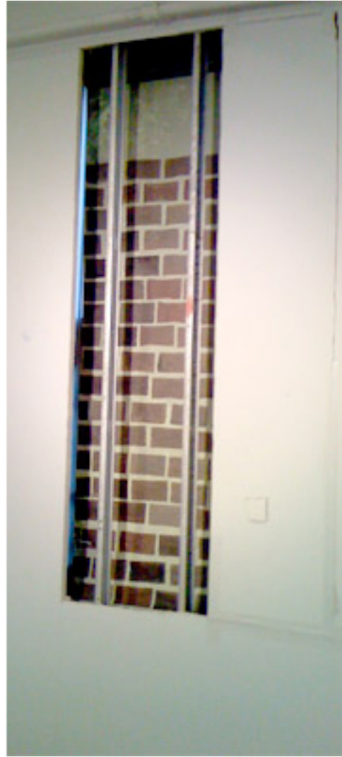
Lisa Sigal, Two Shades , 2007. Mixed media, 118×27 in. Courtesy Frederieke Taylor/Lisa Sigal, The Brick Piece , 2007. Mixed media, 102 × 54 × 16 in. Courtesy Frederieke Taylor