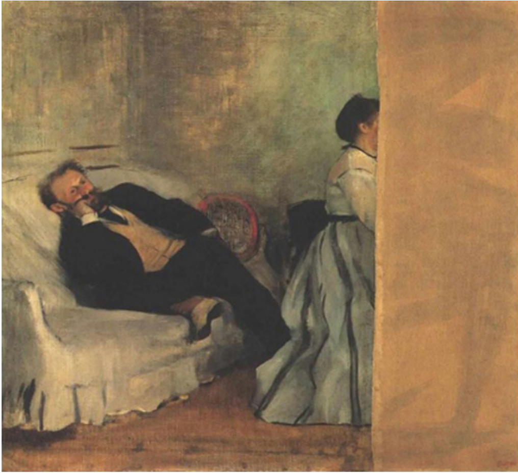
Edgar Degas, Portrait of Monsieur and Madame Edouard Manet

Here is a color photograph of that same work. One of the most notable features of the painting is a strange border on the right edge.