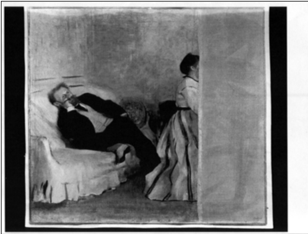
Edgar Degas, A4 Photocopy of Portrait of Monsieur and Madame Edouard Manet

It took a little longer for me to see that there was something, too, about my photocopy that caught my interest.