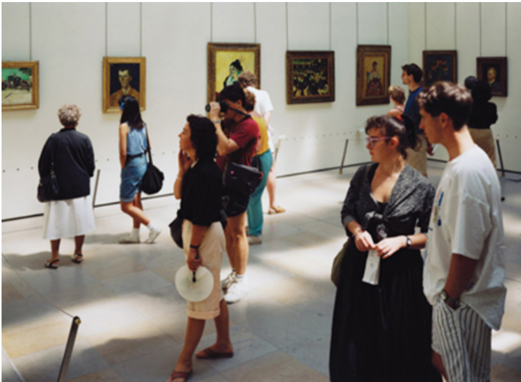
Thomas Struth, Musee d'Orsay I

I spent much of my time in Paris luxuriating in looking at paintings I expected I'd never be able to see in such an unbounded way again. I would go to the Musée d'Orsay - where the most Manets are on view - only to look at a single room, or a single work, without feeling the responsibility of taking it all in at once. I knew I could always come back the next day. More or less, this was the scene (though this is a Post-Impressionist room):