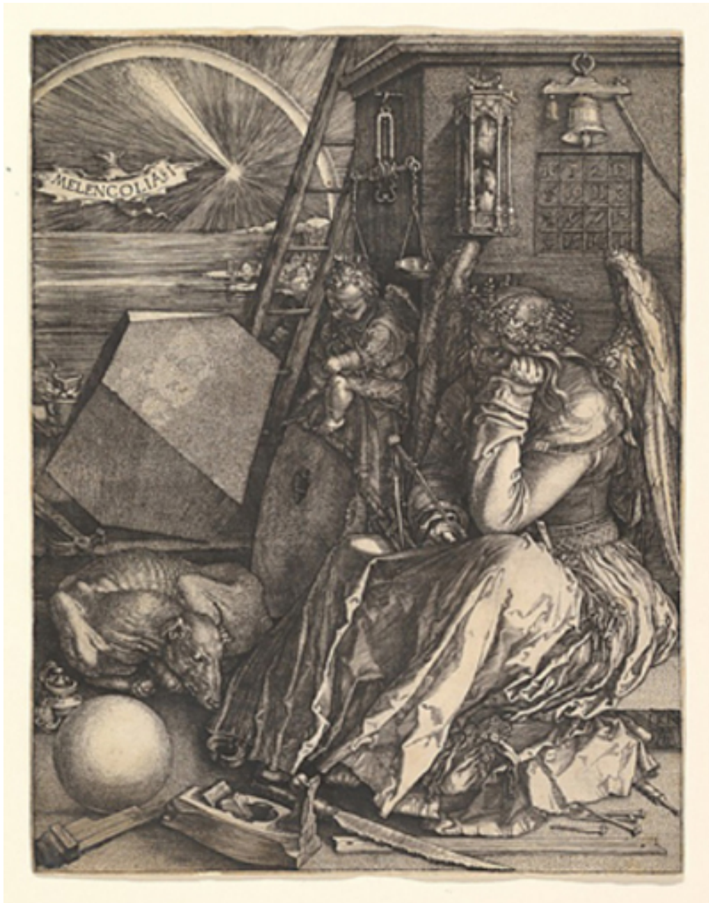
Albrecht Dürer, Melancholia I

The pose reminded me of an image by another artist I greatly admire. (I don't know, but I wouldn't be surprised if Degas was intentionally quoting Melancholia I in this painting, hyper-conscious as he was of art's histories.)