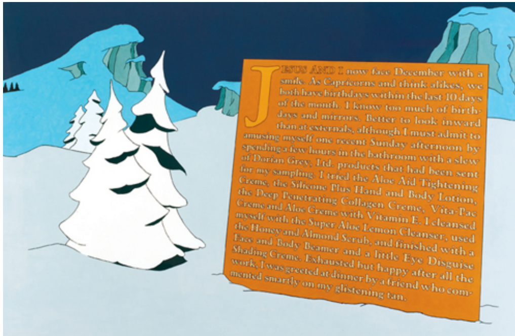
Larry Johnson, Untitled (Jesus + I) , 1990, Color photograph, 46 5/8 x 61 inches (118.4 x 154.9 cm), Edition of 3.

Untitled (Jesus + I) (1990) is one in a series of pieces set in an anonymous snowy landscape. As with all of Johnson's work, Untitled (Jesus + I) is a color photograph that could be confused for a drawing or painting. It is large, somewhere between a flat-screen television and small movie screen projection, and it is rendered to look like an animation cell. The backdrop of hills and trees is colored in cool tones, while a large orange sign-present in all of the works from this series-is firmly planted in the snow-covered ground. The cartoony Garamond typeface of the sign verbosely tells the story of "looking inward rather than at externals," and proceeds to list the many "Dorian Grey, Ltd." skin care products that had been sampled before attending a dinner party. The story is circuitous; starting with "Jesus and I" and ending with "my glistening tan," the lack of logic is hysterical.