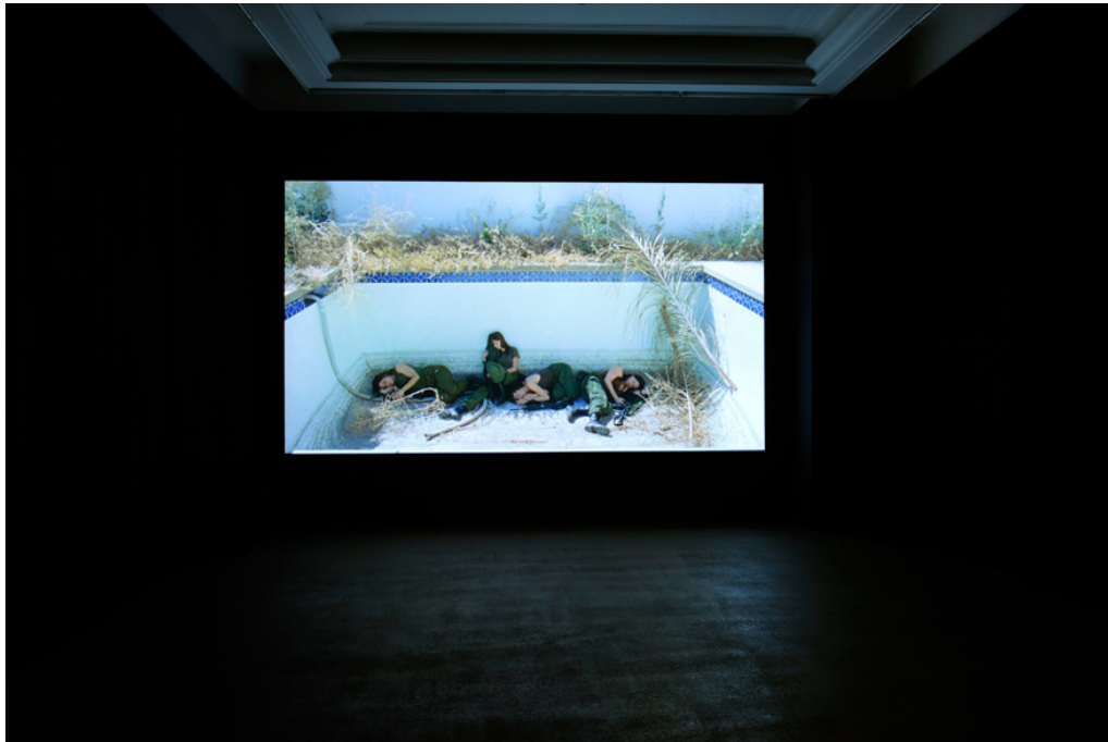
Amie Siegel, Black Moon , 2010. Installation view, Krome Gallery, Berlin.

photographs, Black Moon ? Hole Punches , based on the standard practice in motion picture laboratories of punching a hole in the first frame of a film negative.