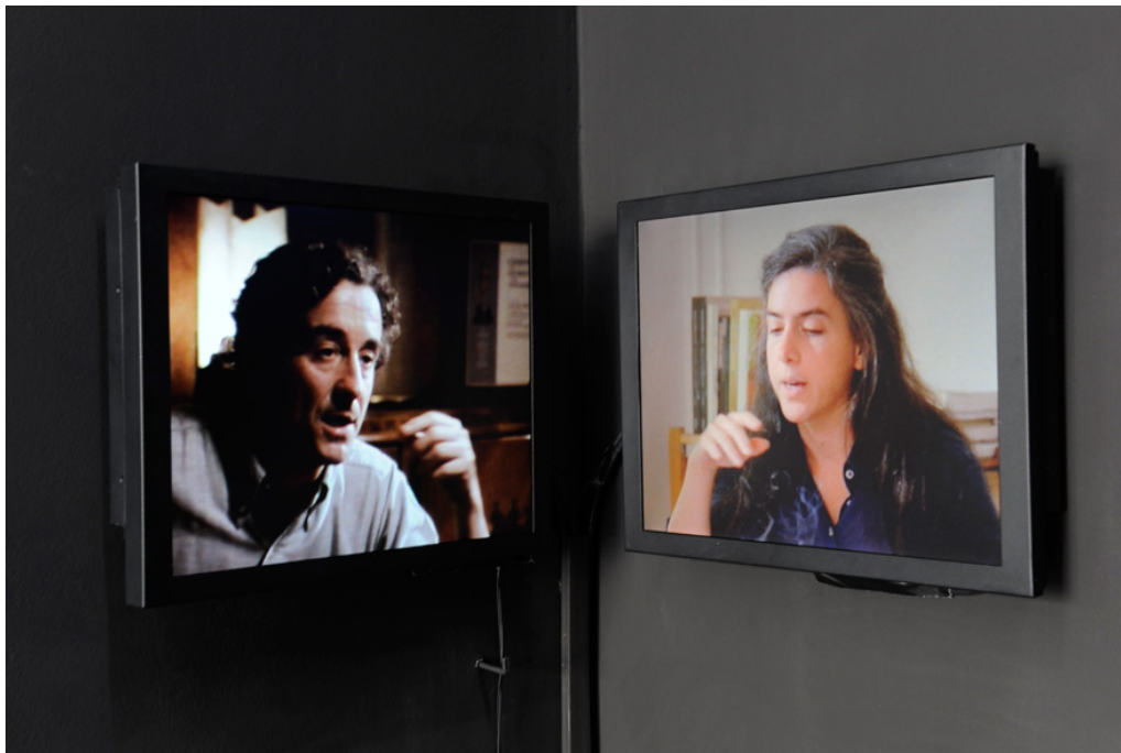
Amie Siegel, Black Moon ? Mirrored Malle , 2010. Installation view, Krome Gallery, Berlin.

work where the camera and an actor are together in a room feel surprising and eventful. (There is exactly one such shot in her 1999 film The Sleepers .) The setting in her Black Moon runs together exterior shots taken at various locations to create a fantastic space. The common thread linking the shots is architectural: we are looking at images of unfinished and abandoned housing developments in the California desert and Florida with names like "Pleasant Valley." Instead of making the fantasy discontinuous, Siegel finesses the connections so that the different places appear to occupy the same space. A small group of soldiers - detached from a larger unit? lost? survivors of an ambush? - occupy the abandoned housing development. But they don't occupy the unfinished houses. Like Siegel, they prefer the exteriors of buildings; they enter the houses to do radio work or security checks, but they sleep and build fires in an empty swimming pool. They seem to be on the defensive. They never fire their weapons, but they are menaced by sounds of explosions and gunfire, and sometimes by the discovery of the corpses of their comrades.