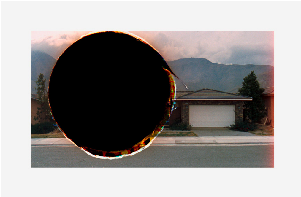
Amie Siegel, Black Moon ? Hole Punch No. 9 , 2010. C-Print, 13.5 × 24 in.

In the last sequence of the film, the soldier who appears to command the unit looks at pages from a fashion magazine. Abandoned in the desert, the magazine is practically the only artifact of human civilization in the world of the soldiers, if you except the structures and roads of the housing development itself. That may sound like a big concession, but not if you contrast the interiors of the country house in Malle's film; they are bulging with books, paintings, musical instruments, carpets, furniture, and other finely wrought things. If the soldiers in Siegel's piece had a civilization, either it has been destroyed, or it was a Spartan one. It does not include anything like art, until the magazine shows up.