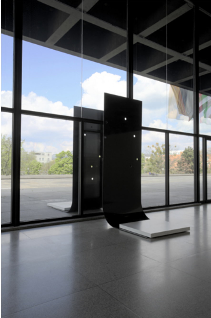
Nairy Baghramian, La colonne cassée, 1871 , 2008. Painted steel 190 × 245 × 140 cm each. Courtesy Collection Wiese. Installation view berlin biennale 5, Neue Nationalgalerie, Berlin.

Intentional or not, the symbiotic relationship of the like minds of Janette Laverrière and Nairy Baghramian is apparent in the formal aspects of their work. Whether it be from Laverrière's long practice in furniture-making, or from Baghramian's shrewd understanding of sculptural art history, the formal elegance that they both possess seems to provide a veneer concealing a powerful undercurrent of political and social meaning. What interests me about their shared ground is the underlying desire to communicate something beyond a