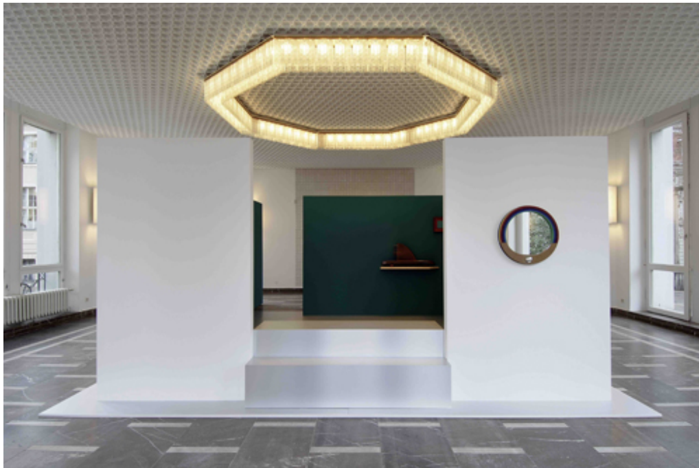
Nairy Baghramian/Janette Laverrière, La Lampe dans l'horloge , Berlin Biennale 2008.

Entering the airy octagonal space of the Schinkel pavilion during last year's Berlin Biennial, I was pleasantly confused by what I saw: A structure within a structure, clean white on the outside and crisp turquoise inside; asymmetrical walls displayed a few sparsely hung objects with delicate grandeur and poise. The mostly mirrored items, seemingly initiated by utility, discreetly revealed themselves through hidden quotes, symbols and clues about figures from literature, politics and history. À Gustave Courbet, Vanité, Dorian Gray , read the titles of the mysterious pieces. Chacun sa vérité was another title, of a piece in which red lacquered oak shutters partially obscured a curved mirror embedded in varnished mahogany, with the name Pirandello delicately inscribed at the top-an inscription so subtle that it took a second glance. Like portholes inviting inquiry, these playful and secretive objects revealed a very personal repertoire of homages, recollections and ideology. However, the indulgent materials -speckled maple, sycamore, pear wood-as well as the precision and delicacy of the pieces seemed out of place-reminiscent of an earlier generation, influenced by years of working for a master craftsman. Where, I found myself asking, did they come from?