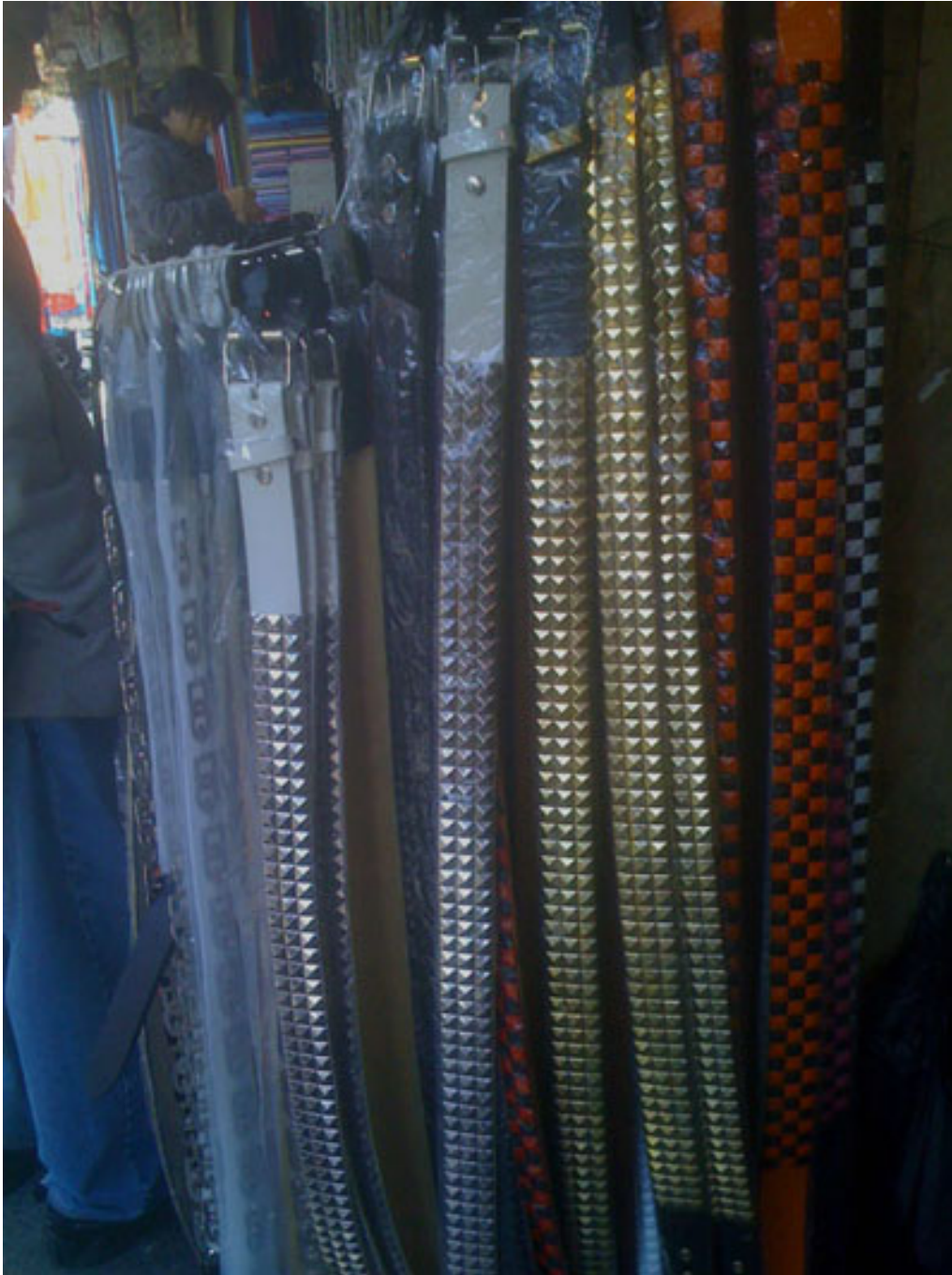
Studded belts at St. Mark's vendor, 2008.

IC: I've experienced your work over so many years now and in it-and certainly this yields true for many artists-elements circle around and come back into play. Things gather, come to the foreground, then recede, only to resurface later. One of those elements, currently in the "foreground," are images that teeter on the brink between high fashion and just plain St. Mark's garbage-things that allude to a certain lifestyle, but are affordable for any teenager from New Jersey: