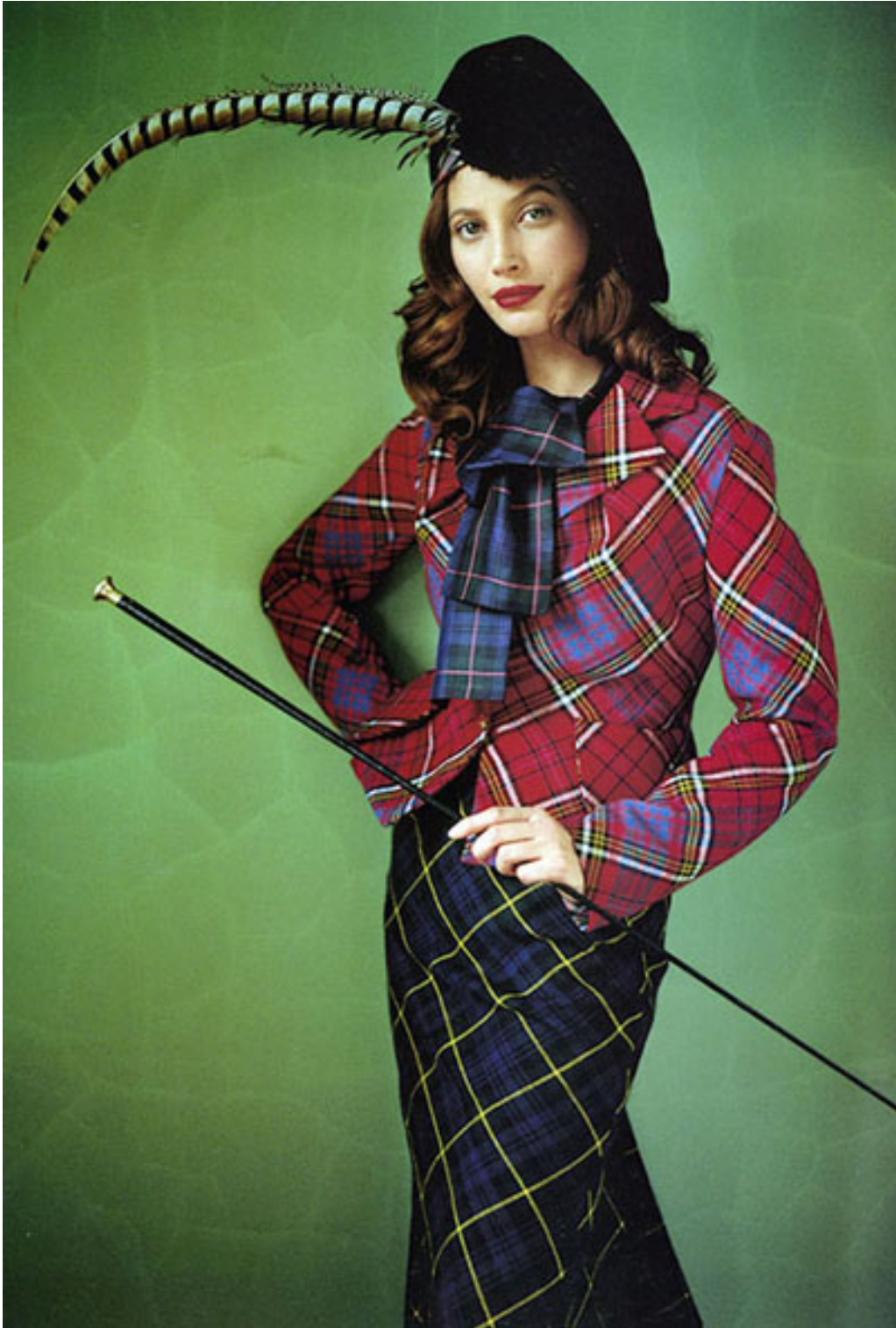
Image from a Vivienne Westwood collection.

IC: Nor would they select these same materials.