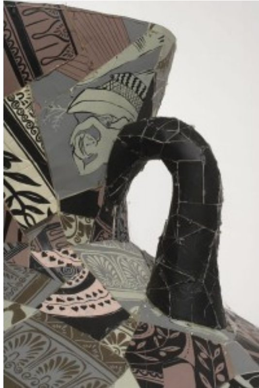
Ruby Sky Stiler, Old Friend From The Future , detail, 2008, Foam core, hot glue, acrylic paint, bristol board, pedestal, 34×35×78 inches.