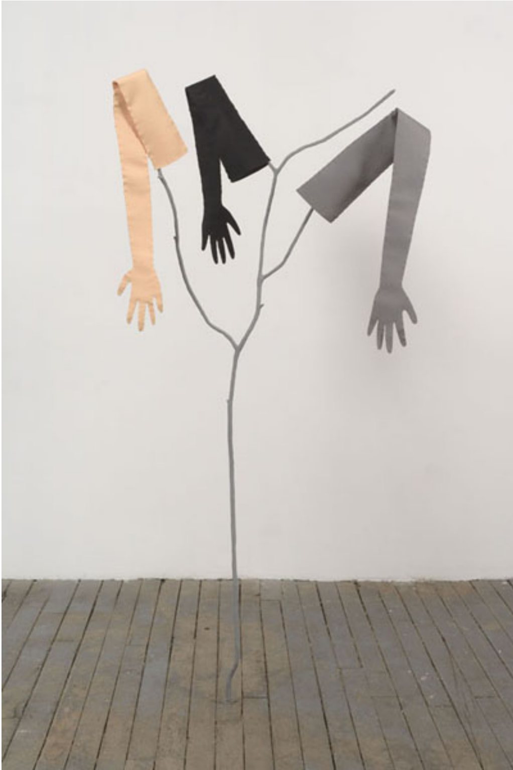
Ruby Sky Stiler, A New Scary Thing , 2008, Steel, polymer clay, acrylic paint, wool felt, 32×32×72 1/2 inches.