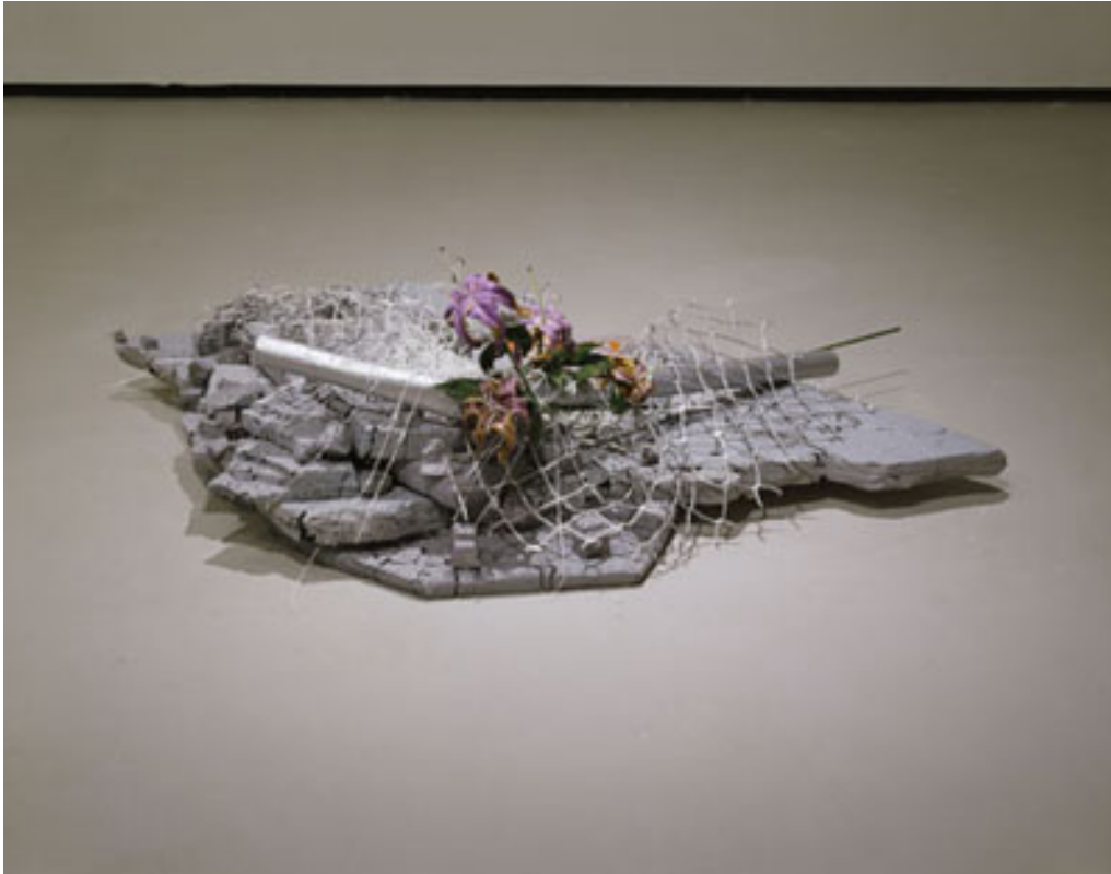
Ruby Sky Stiler, Presenting The End of The Beginning of The End , 2006, Mixed media including foam, paper, acrylic paint, glue, polymer clay, 48×50×35 inches