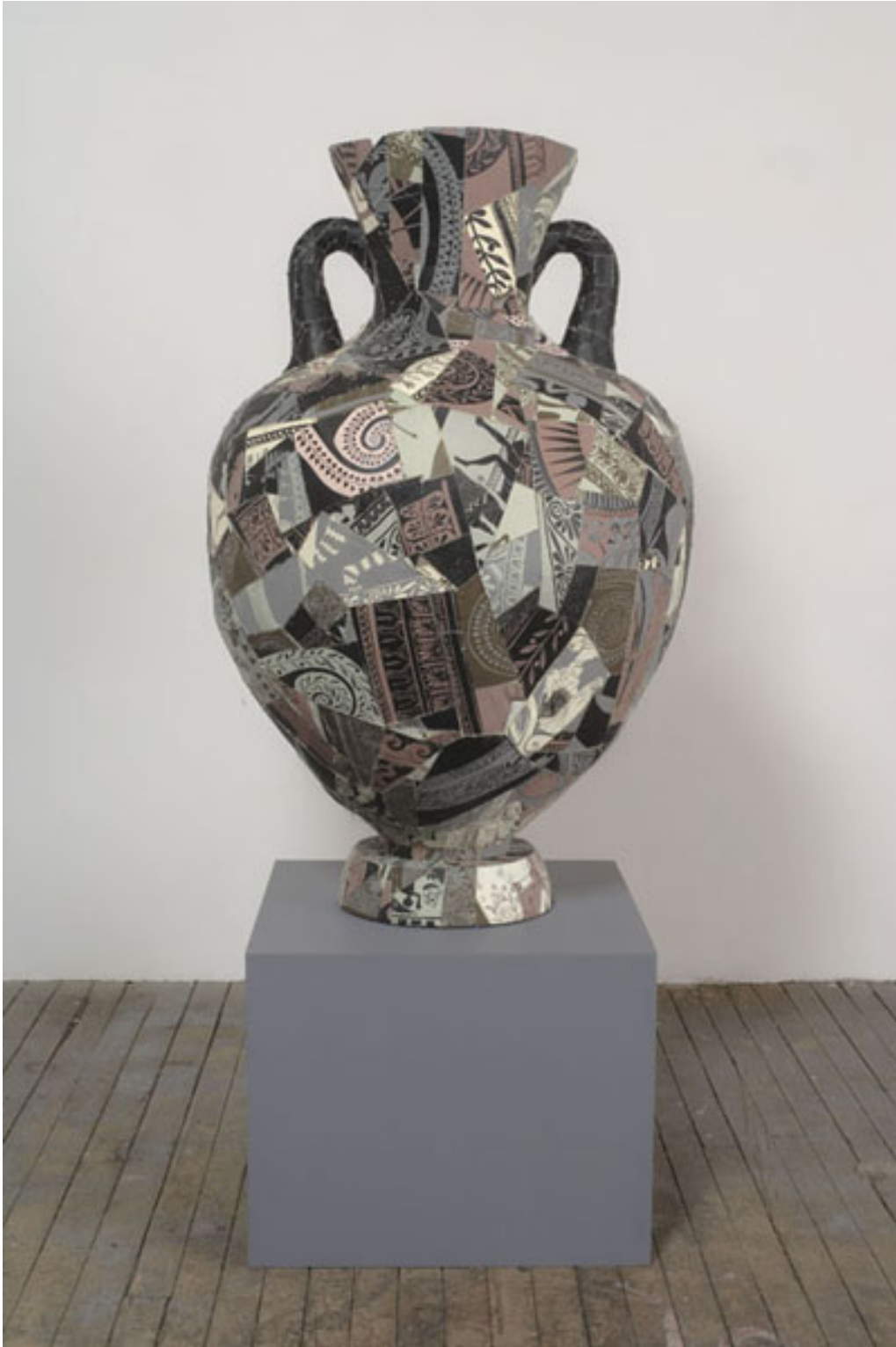
Ruby Sky Stiler, Old Friend From The Future , 2008, Foam core, hot glue, acrylic paint, bristol board, pedestal, 34×35×78 inches.