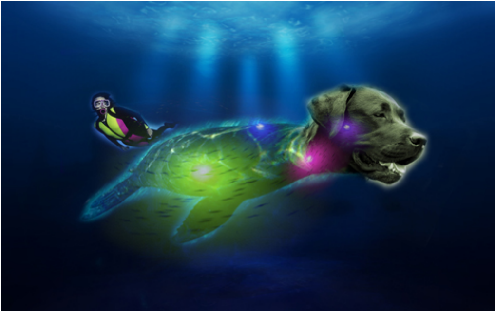
Justin Cole, Underwater Adventure , digitally constructed image, Eamon Ore-Giron, 2012

He pushed play and watched Arturo's dream from last night unfold. In an underwater scene, a slowly approaching behemoth meandered out of a dark canyon of the sea floor. The skin encapsulating the giant, round, barrel of a body was black and shiny like a seal. Its face was an obese Labrador retriever, closed eyes and slight smile. Nuclear Wad noticed dim purple lights casting a throbbing glow within the body of this strange animal, hinting at an electronic core. As the view shifted, he saw a woman in scuba gear gazing upon the creature with an expression ecstatic from the encounter.