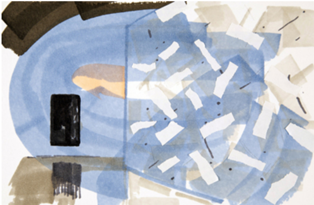
Drawing of front room in gallery.

Robert Irwin recently snuck into New York City and installed one damn good art show. It may have slipped under the critical radar of some, but oh well. It seems to me that Irwin has always played with the contrasts of a bang and a whisper, or soft bangs and big whispers. So perhaps it should have been no surprise that Red Drawing , White Drawing , Black Painting was loud, gaudy, enormous, quiet, transcendent, and infinitesimal all at once.