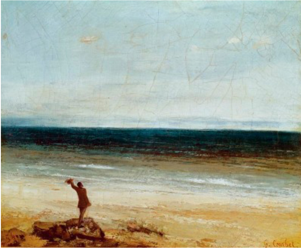
The Beach at Palavas , Gustav Courbet.