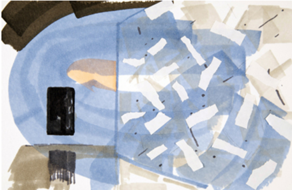
Drawing of front room in gallery.

Robert Irwin recently snuck into New York City and installed one damn good art show. It may have slipped under the critical radar of some, but oh well. It seems to me that Irwin has always played with the contrasts of a bang and a whisper, or soft bangs and big whispers. So perhaps it should have been no surprise that Red Drawing , White Drawing , Black Painting was loud, gaudy, enormous, quiet, transcendent, and infinitesimal all at once.